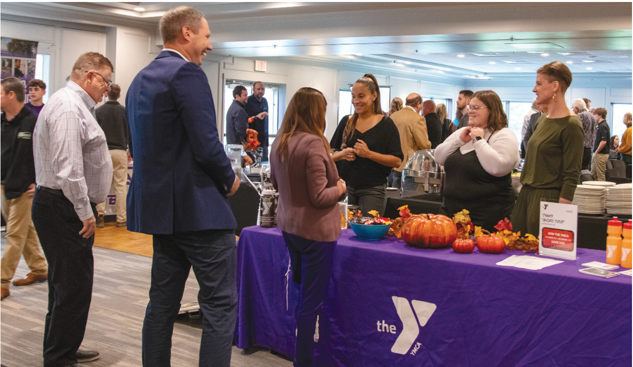
Manufacturers Appreciation Luncheon

Becoming a member of the Chamber of Commerce is more than just joining a business organization; it's making a strategic investment in the future of your business. The value provided by Chamber membership far exceeds the cost, offering an unmatched opportunity to grow your business's visibility, network, and influence in the Greater Burlington community. From online listings and exclusive promotional opportunities to access to high-profile events and community resources, the Chamber provides year-round support that helps businesses of all sizes thrive.